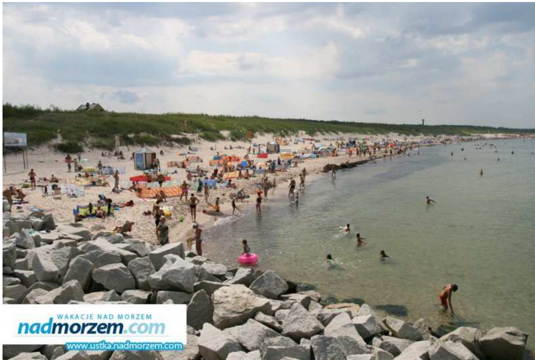
Beach in Ustka