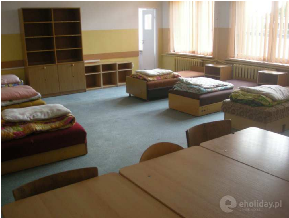
Room for the youth