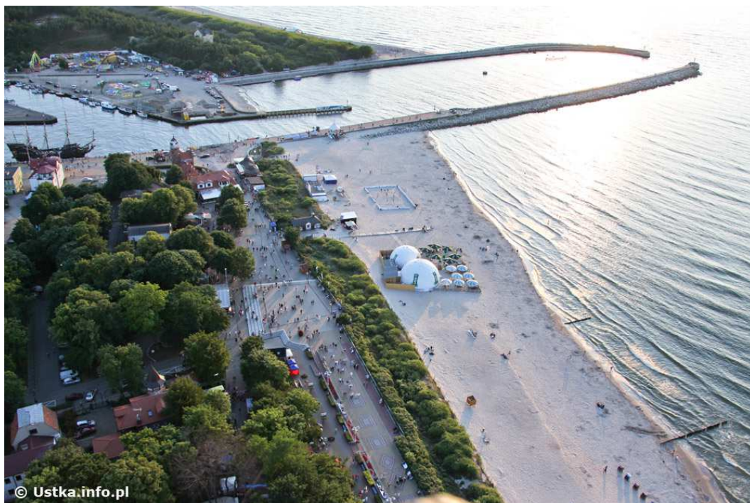
Beach in Ustka

During the project the youth will be accommodated in the integration rooms of 8-10 persons (common accommodation of youth from Poland, Germany and Ukraine). Carers will be accommodated in double and triple rooms. All rooms are equipped with single beds (Quilts, pillows and beddings), bedside tables, wardrobes, tables and chairs. There is also a common room with TV and sound equipment, and a disco hall.