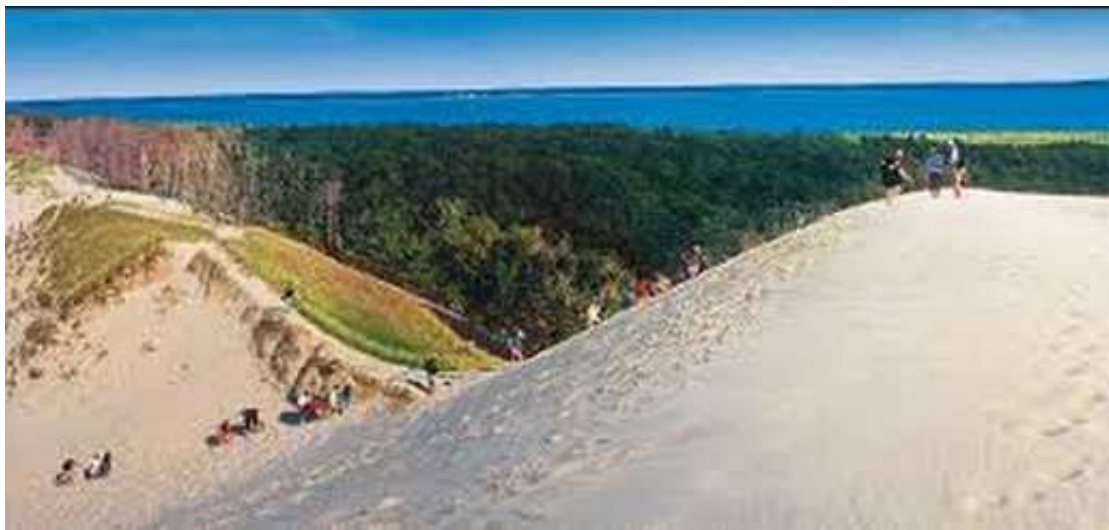
Slowinski National Park