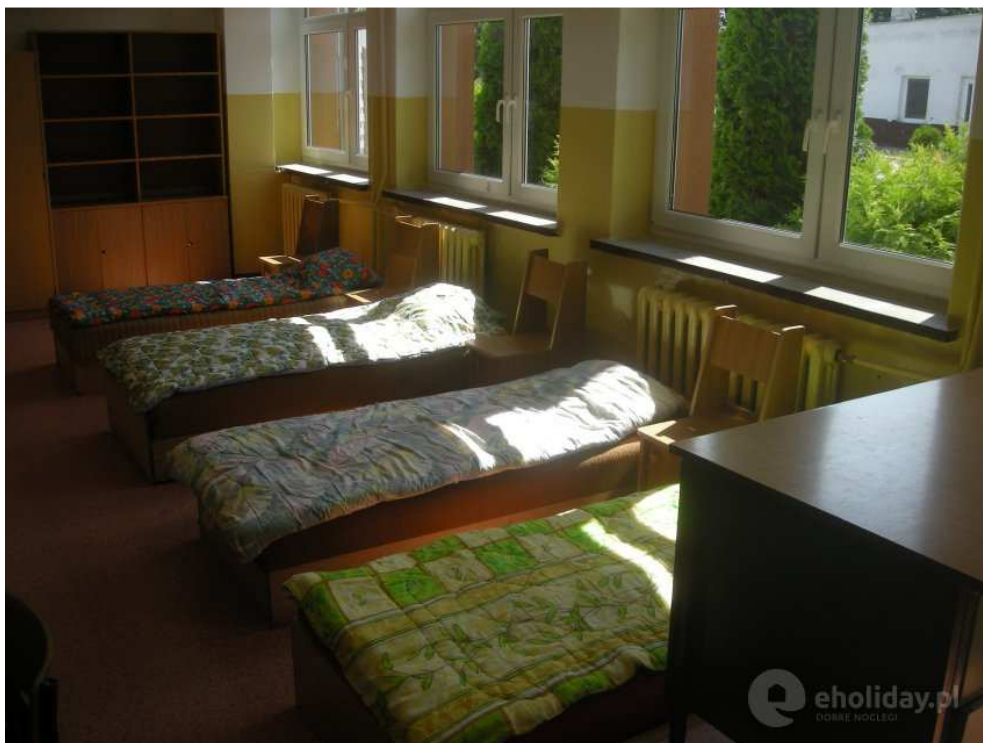
Room for the youth